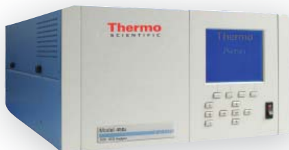
Thermo Scientific Model 450i Hydrogen Sulfide & Sulfur Dioxide Analyzer

You can easily program short cut-keys to allow you to jump directly to frequently accessed functions, menus or screens. The larger interface screen can display up to five lines of measurement information while primary screen remains visible.